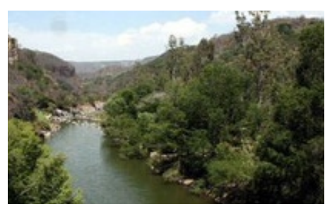
Verde River, Mexico

This infrastructure will provide Los Altos de Jalisco and the city of León-Guanajuato with drinking water