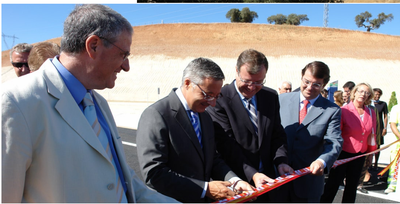
Ribbon cutting on the Cuatro Calzadas-Montejo section