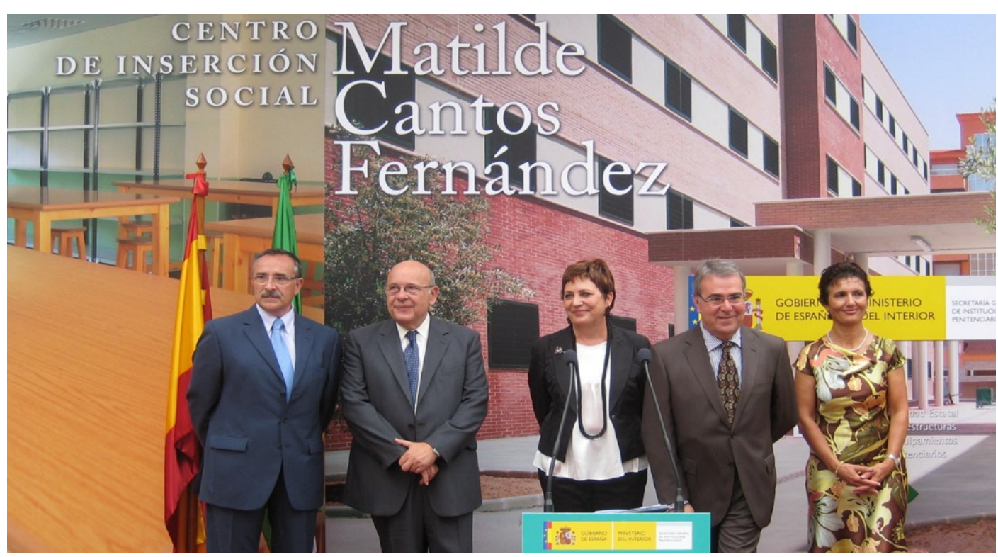
The SIC is opened

The centre has a coffee shop, laundry, library, multi-purpose rooms and a gymnasium as well.