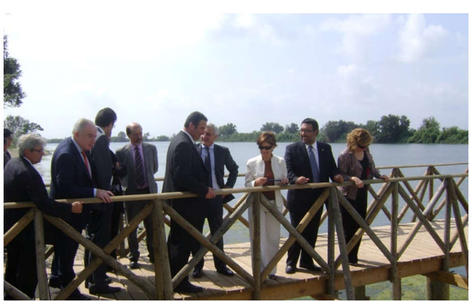
Opening of the Riverside Walk

and 4,492 species of shrubs have been planted.