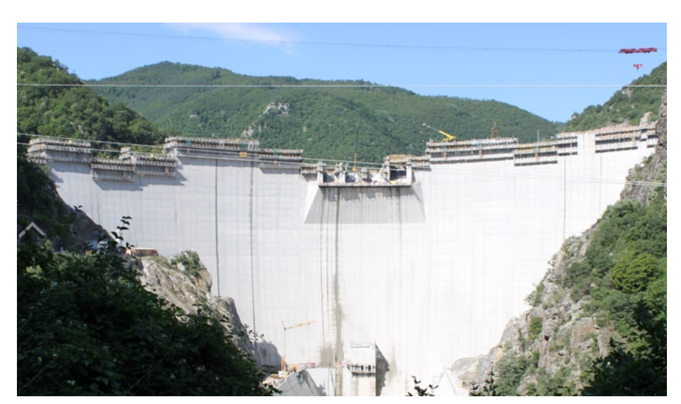
Tsankov Kamak Dam

Tsankov Kamak hydroelectric power plant is situated in the Rhodopes Mountains, near the Greek border, and forms part of the Vacha Cascade. The Vacha River is one of the biggest in