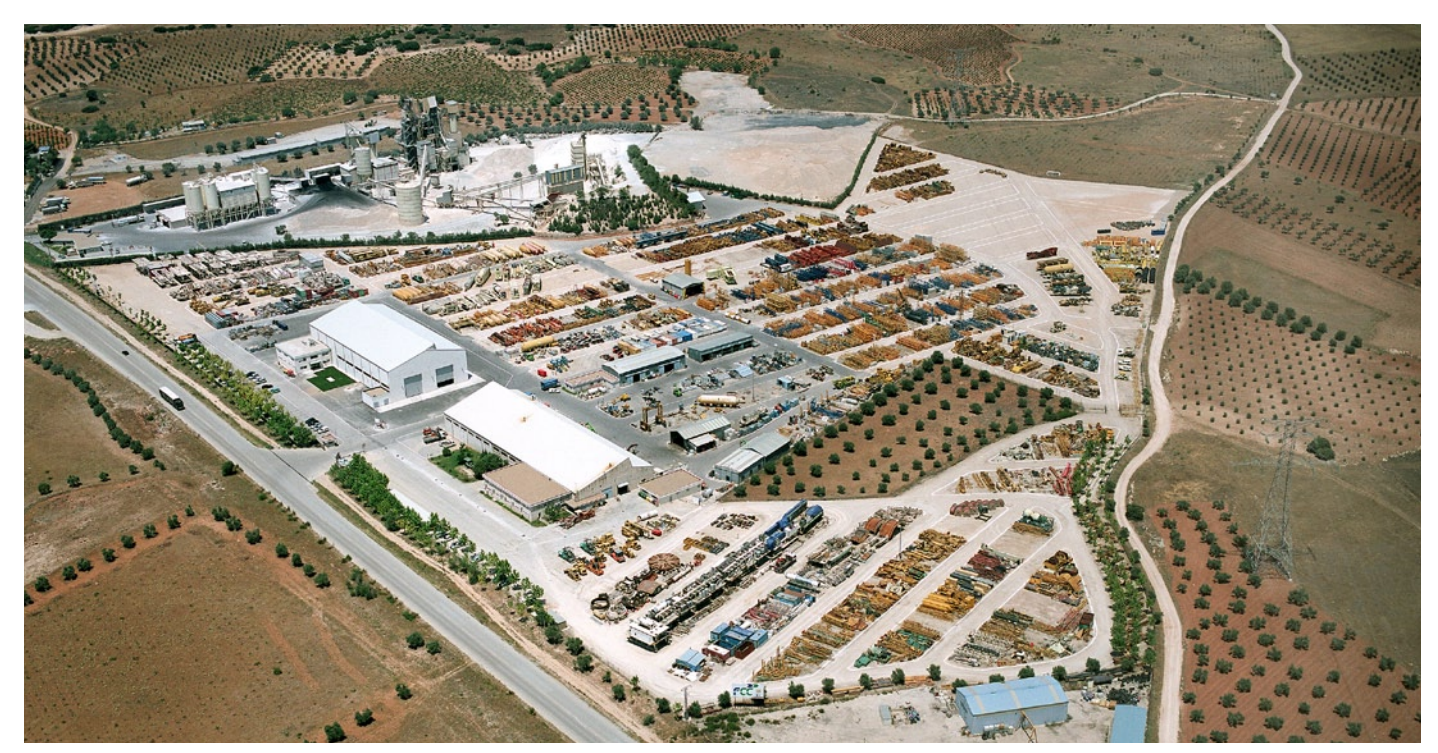
FCC Construcción's Machinery Pool

At FCC Construcción, the Management Office for Machinery, part of the Deputy Corporate Management Office for Technical Services, is in charge of purchasing, maintaining and running the firm's machinery and auxiliary resources and providing advisory and support service covering everything that has to do with machines and facilities. This includes bid studies, procedure implementation and works execution.