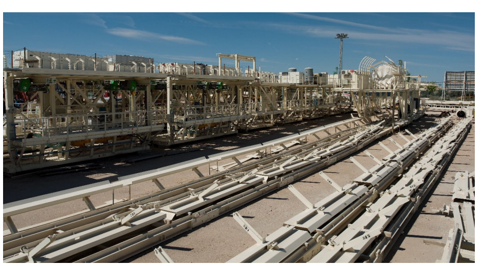
Close up of a TBM

cution. Due to today's high degree of mechanization, especially in major projects, the Machinery Pool is called upon to furnish all kinds of machines and equipment: tunnel-boring machines for tunnelling, special marine equipment for work in harbours, formwork for viaduct building, agglomerate-manufacturing and -spreading equipment for roads and facilities for making and placing concrete in dams.